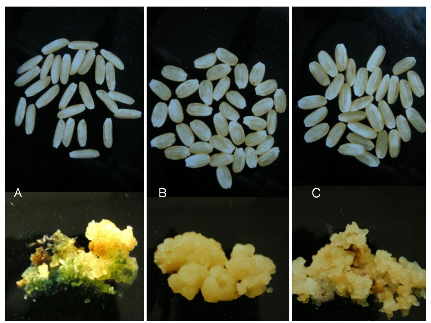
Figure 1. Grain (top) and callus morphology (bottom) of IR54 (A) with the green portions of the callus mass, yellowish and compact callus of Nipponbare (B),and yellowish, granular callus of Rinatte (C) under IM 4 weeks after culture.

Callus type of each subspecies differed from one another under IM. At 2 weeks after culture, calli of Indica varieties IR 54 and Toboshi were characterized by the presence of two types of callus masses: one was light yellow, compact, smooth surfaced and the other was yellowish with hair-like projections and tiny green spots. Khaleda and Al-Forkan (2006) also reported embryogenic type of callus in Indica rice varieties