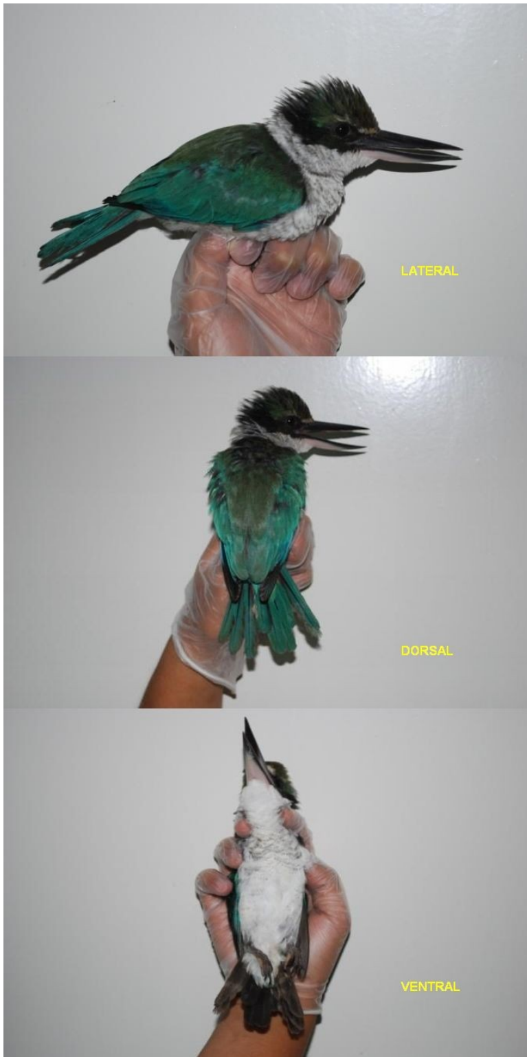
Figure 1. Representative specimen (UPD10) of Todiramphus chloris from UP Diliman

Species identification is a crucial step in all biological studies. Without proper species identification, appropriate action regarding biological issues would be ineffective (Armstrong and Ball 2005). However, traditional taxonomy may sometimes fail in its role in effective species identification, or there may not be enough qualified people to do proper identification. Scientists are therefore looking for more rapid and accurate methods of species delineation that rely less on taxonomic expertise. DNA barcoding can address this problem (Hebert et al. 2003, Tautz et al. 2003). Molecular techniques provide far more accurate and quantitative means of species identification than morphology-based methods. So far, DNA barcoding performs well in unraveling a whole new wealth of information that it is expected to provide more insights on taxonomy and systematics (Hebert et al. 2003, Hajibabaei et al. 2007). Hebert et al. (2004) proposed that a 650-bp fragment from the 5' end of the cytochrome c oxidase subunit I (COI) gene be used as a barcode marker for animals.